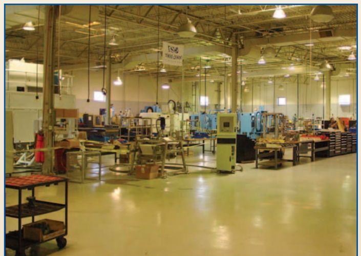
Fully air conditioned warehouse