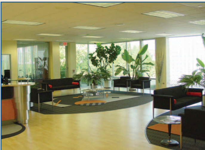
Class "A" office area